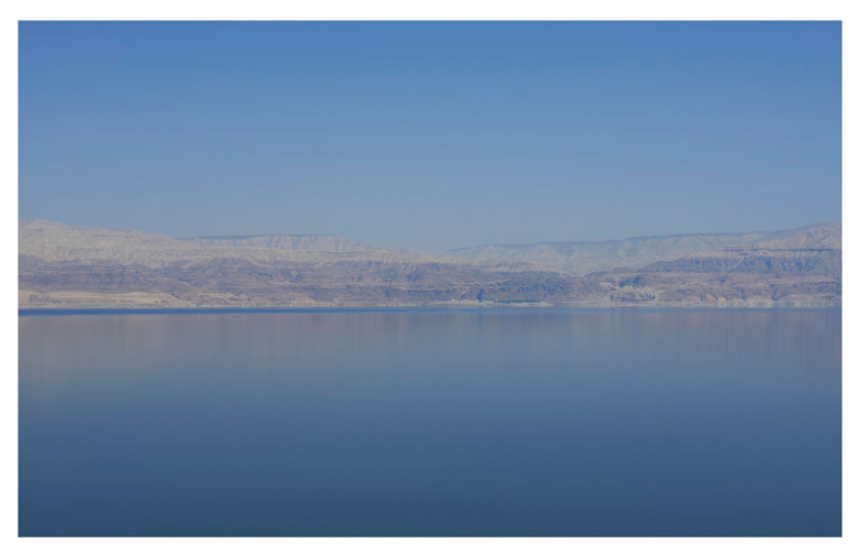
deadcalm distance 101 closeupatadistance 2016 series, 113 cm x 180 cm (unframed), Museo® Silver Rag archival photographic paper 300gsm