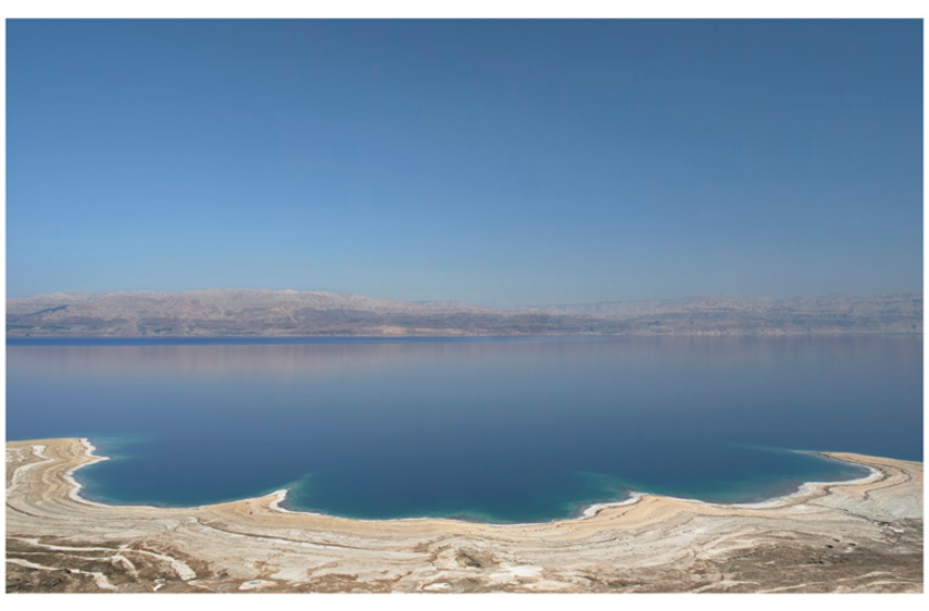
deadcalm distance 132 closeupatadistance 2016 series, 150 cm x 240 cm (unframed), Museo® Silver Rag archival photographic paper 300gsm images courtesy the artist and Kronenberg Wright Artists Projects, Sydney