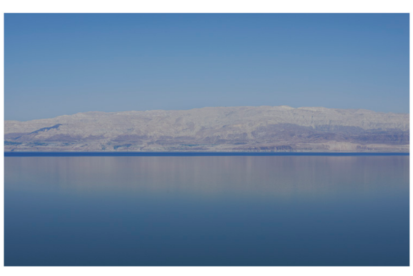
deadcalm distance 100 closeupatadistance 2016 series, 113 cm x 180 cm (unframed), Museo® Silver Rag archival photographic paper 300gsm